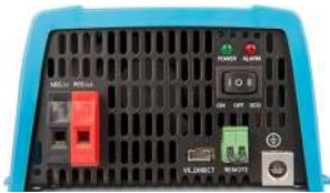
Phoenix 12/375 VE.Direct