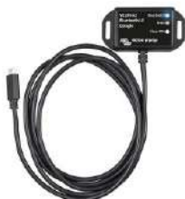
VE.Direct Bluetooth Smart dongle (must be ordered separately)

An excessively high or low battery voltage is indicated by an audible and visual alarm, and a relay for remote signalling.