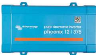
Phoenix 12/375 VE.Direct