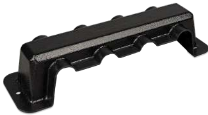
Cover for busbar 250 A with 4 terminals