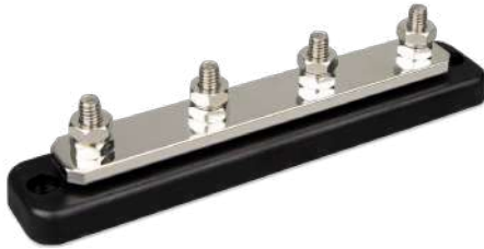
Busbar 250 A with 4 terminals without cover