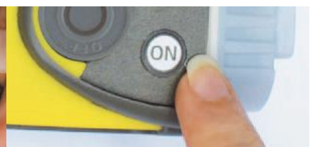
3 Press the ON button.