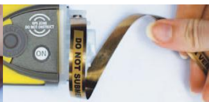
2 Unfurl the antenna.