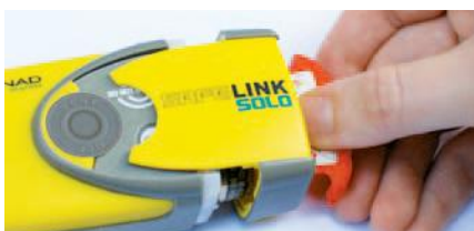
1 Tear off red anti-tamper lid.