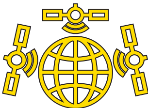
Multi Constellation GNSS for precision global coverage